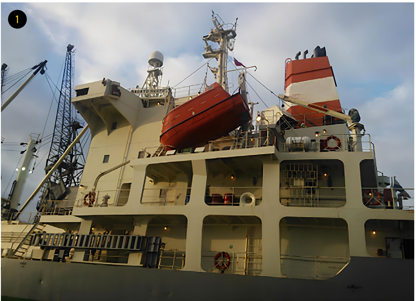
FIGURE 1 PORT SIDE LIFEBOAT AFTER THE INCIDENT

A REFRIGERATED CARGO SHIP HAD BERTHED IN SOUTHAMPTON TO DISCHARGE A CARGO OF FRUIT. ON THE DAY OF ARRIVAL THE LOCAL PORT STATE AUTHORITIES HAD BOARDED THE SHIP IN ORDER TO CONDUCT A PORT STATE CONTROL (PSC) INSPECTION, WHICH INCLUDED A LIFEBOAT DRILL. WHILE SECURING THE LIFEBOAT AFTER THE DRILL, THE SHIP'S BOSUN SUSTAINED MINOR INJURIES AS THE FORWARD END OF THE LIFEBOAT FELL FROM ITS DAVIT DUE TO IT NOT BEING CORRECTLY RESET WHEN IT WAS HOISTED FROM THE WATER ( FIGURE 1 ).