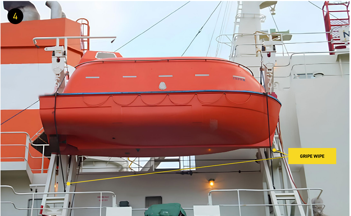
FIGURE 4 GRIBE WIRES (ON STARBOARD LIFEBOAT)