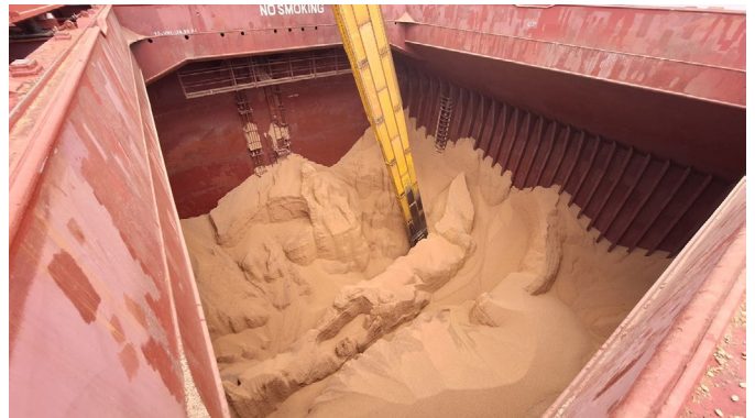
FIGURE 6 Deep seated caking present in soya bean cargo discharged by unloader

Upon arrival at the discharge port, the crew should document the initial hatch cover opening. Photographs and observations should capture the conditions of the cargo surface. If any evidence of damage is observed, discharge should be paused. We recommend that the Club is notified promptly, and that an experienced surveyor is appointed to represent the Member's interests.