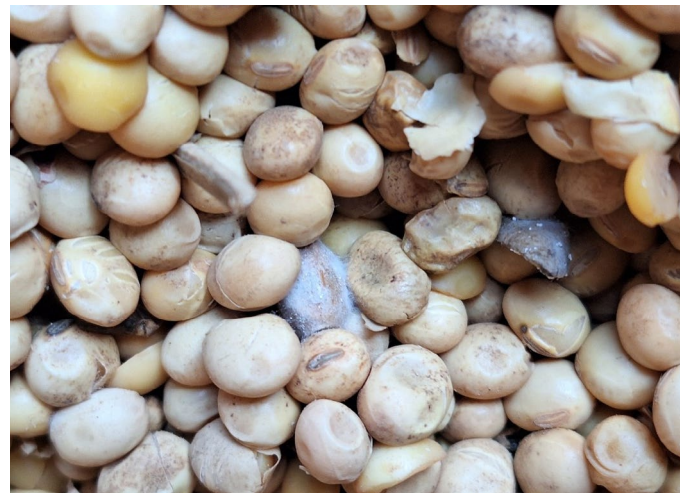
FIGURE 2 Caked areas are often hot and can contain visible mould (white growth at centre)

Once this cycle becomes established, it can continue spreading within the stow, leading to self-heating, mould growth, caking, and ultimately heat-damaged beans. In severe or prolonged cases, the temperatures generated may approach levels at which charring or even a fire risk could develop. However, such cases are extreme and would require an extended period of instability to develop.