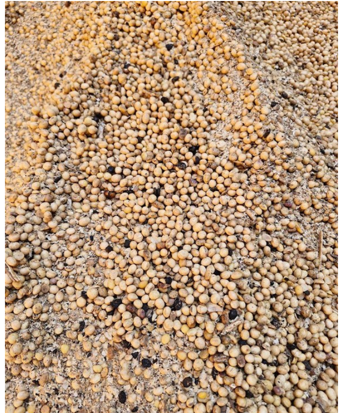
FIGURE 4 Drier or bin burned soya beans mixed with sound soya beans. Cargo temperature was low and burned beans dispersed indicating they originated preloading.

loading (+10°C above ambient or cargo temperature above 35/40°C), a letter of protest may be issued.