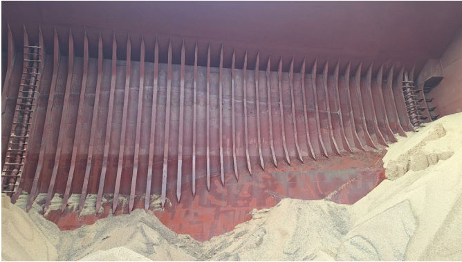
FIGURE 7 Mouldy cargo residue left on side steelwork related to a surface mould crust

Where feasible, a segregation of sound and affected cargo should be carried out to mitigate losses. Representative sampling may assist in determining the cause and extent of deterioration.