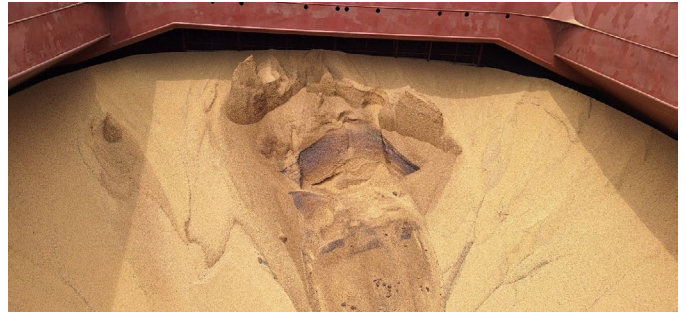
FIGURE 5 Heat-damaged layer present in a cargo of soya beans. The dark central layer contained high concentration of other mixed types of grains and foreign matter indicating the loading of a contaminated parcel.

Upon arrival at the discharge port, the crew should document the initial hatch cover opening. Photographs and observations should capture the conditions of the cargo surface. If any evidence of damage is observed, discharge should be paused. We recommend that the Club is notified promptly, and that an experienced surveyor is appointed to represent the Member's interests.