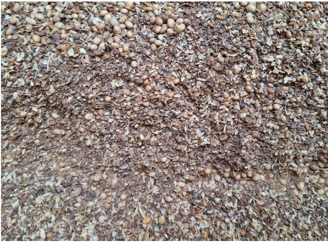
FIGURE 3 Localised foreign matter and dust often leads to development of hotspots. Above shows a caked area hotspot with high foreign matter content and darker discolouration.

In many claims, the physical manifestation of deterioration, darkened beans, odour, caking and mould are reported. These conditions are often attributed to poor ventilation during the voyage, however, when self-heating manifests within the cargo mass, it is frequently a result of a pre-existing instability. Shipboard ventilation can only replace the air in the cargo headspace and has no effect on the bulk cargo conditions. It is important to carefully review the available evidence and pattern of damage to determine the cause of the damages.