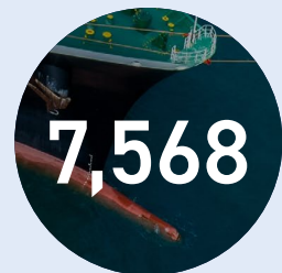
ENTRIES HAVE BEEN PUBLISHED IN THE SYSTEM SO FAR