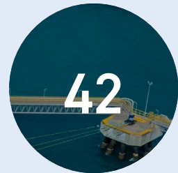
MACN MEMBERS JOINED