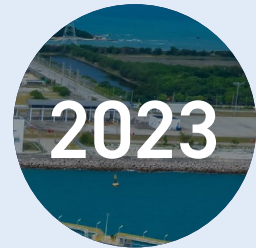
LAUNCH OF PLATFORM

Since its launch, 42 MACN members have joined the platform and over 7,500 entries have been published on the system. The revenue from 3 Sea Diligence will be reinvested into MACN initiatives that provide the wider industry with training, tools and action for anti-corruption compliance.