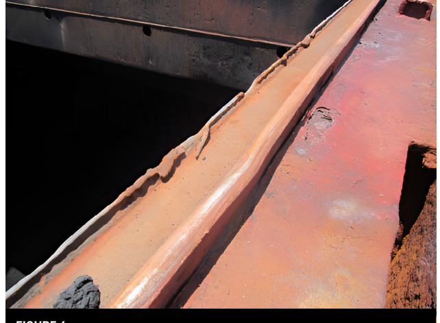
FIGURE 4 Mechanical damage to the compression bar and inner drain channel