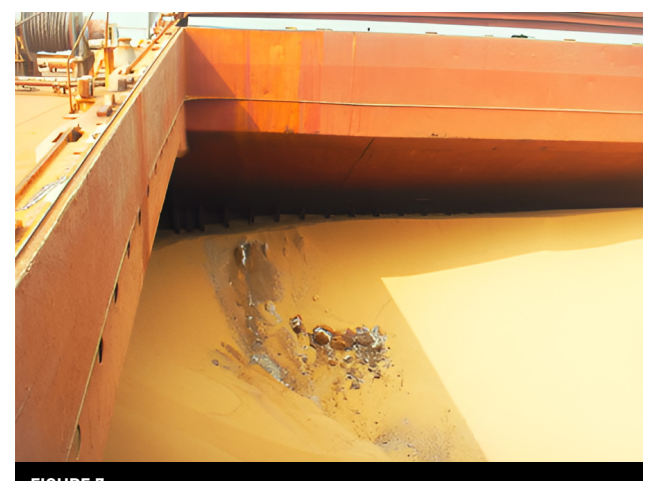
FIGURE 7 Evidence of water ingress at the cargo hold entrance hatch and the hatch coaming

7. Check and clean the surface of the seals. This is particularly important if the cargo being carried is gritty or dusty.