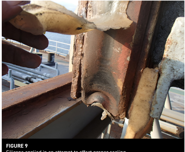
Silicone applied in an attempt to effect proper sealing

8. When cleaning the seals, check for signs of permanent deformation (a useful general rule is 30% of the seal thickness). If sections of sealing rubber are required to be replaced, the minimum length is 1m. However, it is often better to replace a full length of sealing rubber to ensure effective and even compression.