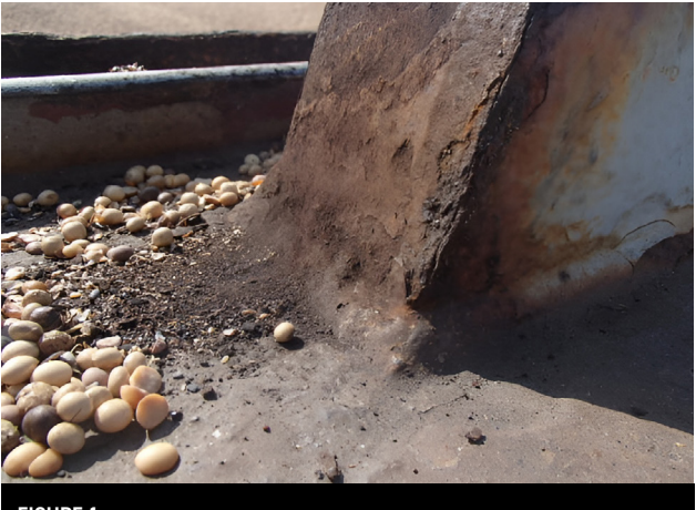
FIGURE 1 Hatch coaming not swept, cargo debris and rust still evident. Centreline joint closing wedge showing severe wear

Before closing the hatch covers, ensure that the hatch coamings and double drainage channels are swept clean of any cargo debris. This will ensure that the coaming drain non-return valve remains clear and free as well as ensuring that no damage occurs to either the hatch cover rubber packing or the compression bar. It will also ensure that there is no obstruction to the correct and proper sealing of the hatch cover.