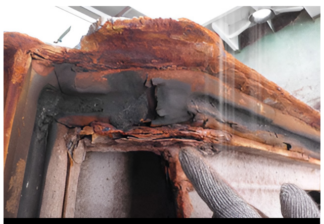
FIGURE 8 Hatch cover sealing rubbers damaged and showing permanent deformation beyond the recommended limits. Rubber seal channels severely corroded.

7. Check and clean the surface of the seals. This is particularly important if the cargo being carried is gritty or dusty.