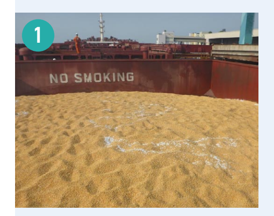
Figure 1: Fumigant can cover extensive area in the cargo hold with little active residue left behind

FUMIGATION NORMALLY STARTS AT THE LOAD PORT AND WILL CONTINUE FOR A DEFINED PERIOD DURING THE VOYAGE, ENDING ONCE THE SET NUMBER OF DAYS FOR FUMIGATION HAS BEEN COMPLETED. ONCE THE HOLDS ARE CERTIFIED AS GAS-FREE, NORMAL VENTILATION OF THE HOLDS CAN RESUME.