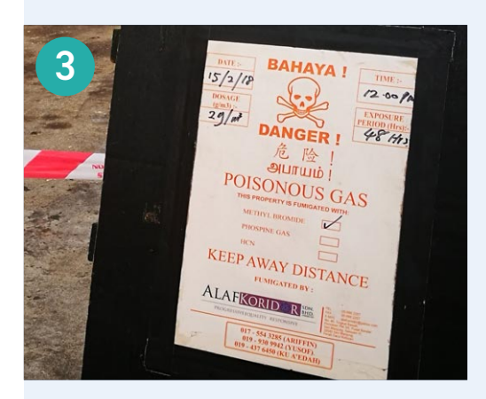
Figure 3: Notice of fumigation in progress

However, its popularity and associated risks have also resulted in the majority of marine fumigation incidents. Therefore, we will focus on fumigation rather than insecticides in this guidance.