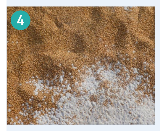
Figure 4: Fumigant residue on cargo of corn