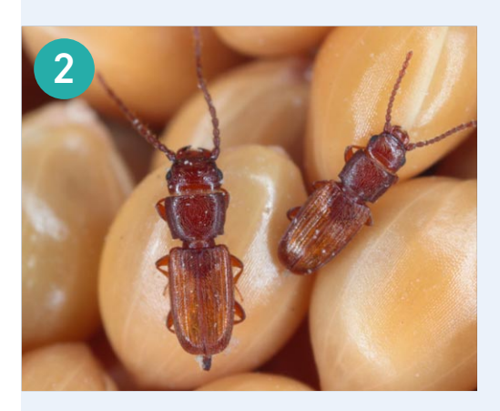
Figure 2: Infestations found on grain cargoes