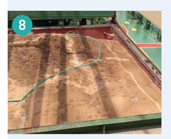
Figure 8: Cargo surface after fumigation explosion and recirculation pipe used

Consequently, when fumigation gas is released into the cargo holds' headspaces it creates a potential explosion risk, particularly when coupled with ignition sources such as unsafe cargo hold lighting, fans or portable equipment, exposed electrical circuits, and sparks from opening hatch covers, all of which could ignite an explosive gas concentration inside the cargo spaces. Such incidents could occur several days after the fumigation was conducted as concentration of the gas increases. Potential sources of ignition should be removed from cargo spaces or suitably isolated and naked flames should be prohibited on the main deck and surrounding areas until fumigation is complete. It is also important that the fumigator correctly calculates the dosage based on the volumetric space and that the holds are free from excess moisture.