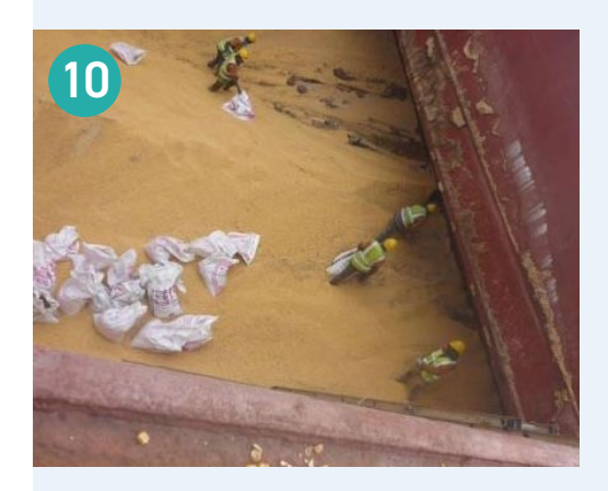
Figure 10: Shore labour cleaning damaged cargo from side coaming in a hold