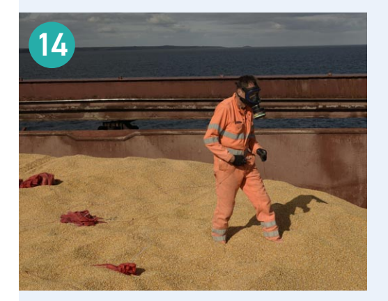
Figure 14: Professional examining fumigated cargo in the hold