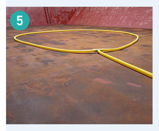
Figure 5: Yellow pipes used for fumigation inside cargo hold