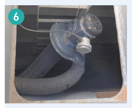
Figures 6: Examples of recirculation fans installed in manholes from different countries – USA and India