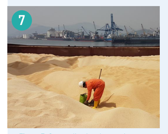
Figure 7: Crew collecting damaged cargo from a cargo hold after gas-freeing