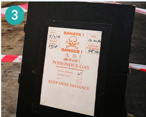
Figure 3: Notice of fumigation in progress

THE IMO CIRCULARS CLEARLY STATE THAT FUMIGATION IN-TRANSIT SHOULD ONLY BE CARRIED OUT AT THE DISCRETION OF THE MASTER.