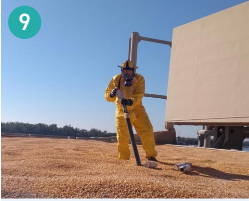
Figure 9: Fumigation carried out onboard by professional

To monitor for signs of fire or fumigation issues in a hold, an infrared handheld thermometer may be useful to detect hotspots on hatch covers and coamings. When phosphine burns, it produces a dense white cloud (phosphorus pentoxide) which severely affects respiration. Crew members should always take precautions when approaching these areas and wear the required respiratory personal protective equipment (PPE).