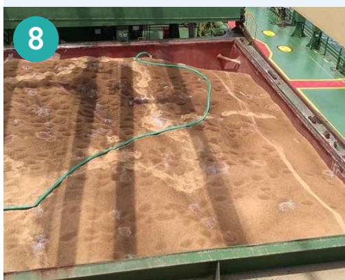
Figure 8: Cargo surface after fumigation explosion and recirculation pipe used

Consequently, when fumigation gas is released into the cargo holds' headspaces it creates a potential explosion risk, particularly when coupled with ignition sources such as unsafe cargo hold lighting, fans or portable equipment, exposed electrical circuits, and sparks from opening hatch covers, all of which could ignite an explosive gas concentration inside the cargo spaces. Such incidents could occur several days after the fumigation was conducted as concentration of the gas increases. Potential sources of ignition should be removed from cargo spaces or suitably isolated and naked flames should be prohibited on the main deck and surrounding areas until fumigation is complete. It is also important that the fumigator correctly calculates the dosage based on the volumetric space and that the holds are free from excess moisture.