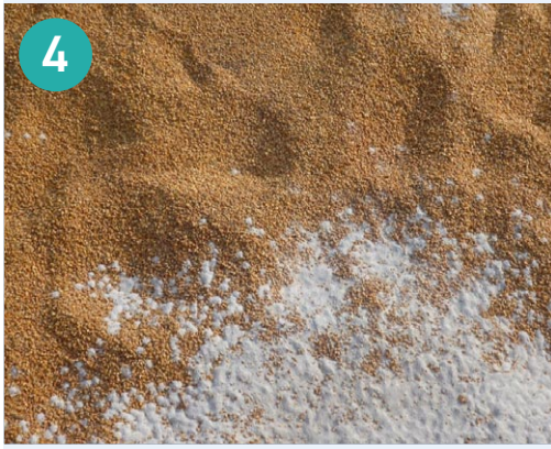
Figure 4: Fumigant residue on cargo of corn