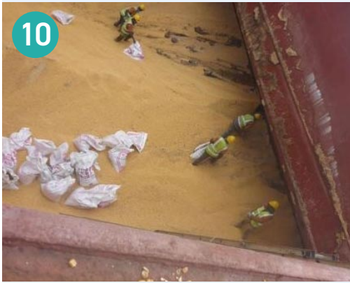
Figure 10: Shore labour cleaning damaged cargo from side coaming in a hold