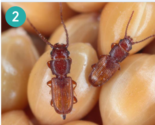
Figure 2: Infestations found on grain cargoes