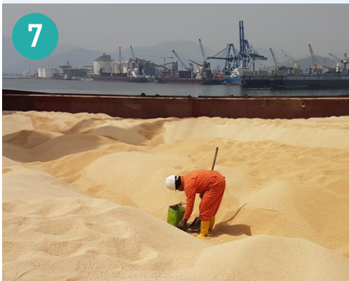
Figure 7: Crew collecting damaged cargo from a cargo hold after gas-freeing

Higher levels of phosphine gas inhalation can cause body weakness, bronchitis, pulmonary edema (abnormal build-up of fluid in the lungs), shortness of breath, and convulsions (seizure or muscle spasms). The longer the exposure period, the higher the chances of acute phosphine intoxication, which primarily damages the lungs and affects the nervous system. Chronic exposure may cause damage to the central nervous system, kidneys and lungs, nasal cavities, adrenal glands, and the testes. High levels of exposure to fumigant gases have led to numerous seafarer fatalities.