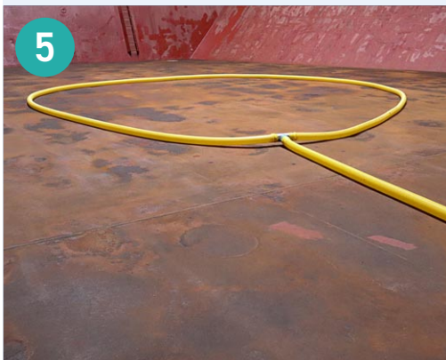
Figure 5: Yellow pipes used for fumigation inside cargo hold