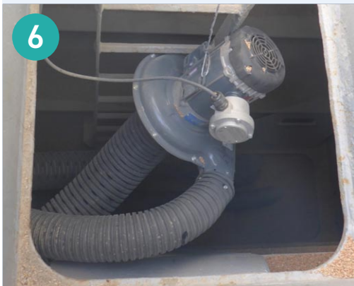
Figures 6: Examples of recirculation fans installed in manholes from different countries - USA and India