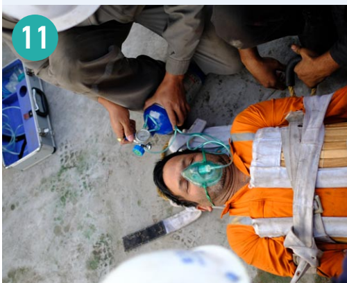
Figure 11: Enclosed space rescue training