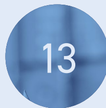
BATON ROUGE UNITED STATES