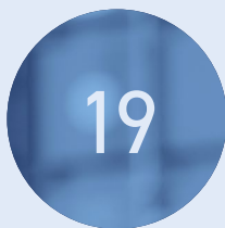
SUEZ CANAL EGYPT