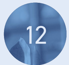
COLOMBO SRI LANKA