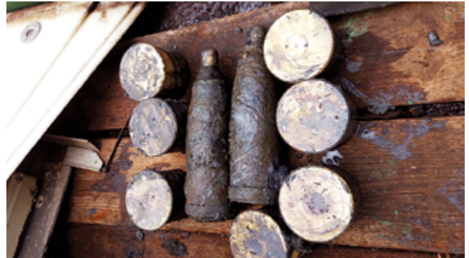
Munitions discovered whilst treasure hunting

CHIRP contacted the Royal Navy bomb disposal unit and their advice is quite clear. Under NO circumstances are any munitions to be handled. Wherever you are in the world, if suspicious materials are discovered then immediately contact the local authorities in order for their experts to assess and deal with the hazard.