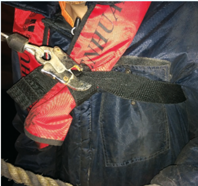
Lifejacket with safety lanyard.

OUTLINE: A report outlining dangers with inertia-wire rope safety lanyards when not used correctly.